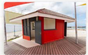
Ingang - Bar